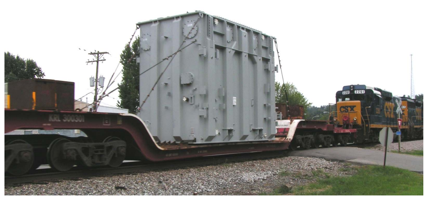
Ricky Bivins caught this over-size load on a south bound CSX freight in front of his home in Mortons Gap, KY, August 5, 2012. Note the GP30 Slug unit in back of the power consist.